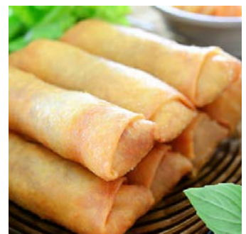
Spring Roll Party Thai Vegetable OZ5021 50 units | 15g

Asian veggies finely sliced with Thai flavours of coriander, chilli, ginger, spring onions & garlic.