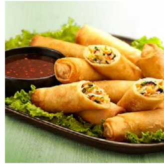
Spring Roll Party Thai Glass Noodle & Veg OZ5025 50 units | 15g

A taste of Thailand with glass noodles, carrot, celery, cabbage & sweet chilli.