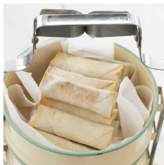
Spring Roll Small Peking Duck LMGSR05 50 units | 23g

Traditional Asian Peking Duck encased in a delicate spring roll