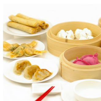
Gyoza Pan Fried Pork OZ1080 50 units | 25g

Pork, cabbage & Asian vegetables, encased in a yellow skin.