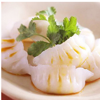
Dumpling Vegetable Vegan OZ1070 50 units | 25g

Vegetables, mushrooms, bamboo shoots & water chestnuts in a crystal skin