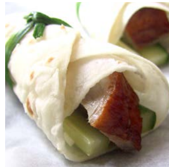
Crepes - Filled Peking Duck OZ8082 20 units

Filled Crepes with a Peking Duck, cucumber, celery and spring onion filling