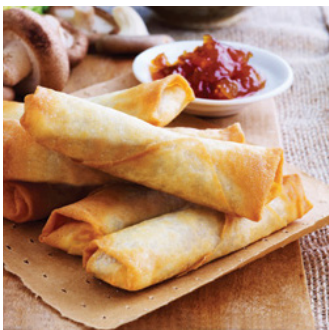
Spring Roll Small Shiitake & Leek LMGSR03 50 units | 23g

A divine mixture of rich earthy flavours balanced with traditional Asian tastes