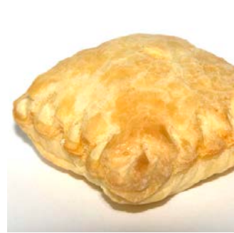
Puff Party Chicken Curry OZ4033 50 units | 30g

An Asian inspired chicken, onion & potato curry wrapped in a light puff pastry parcel