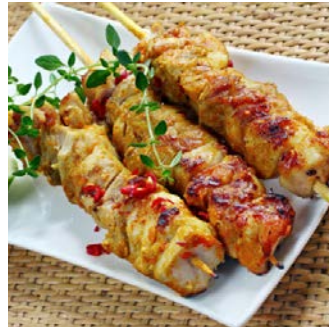
Cocktail Skewers Satay Chicken OZ7010 50 units | 15g