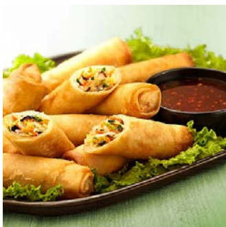
Spring Roll Entrée Chinese Vegetable OZ5050 50 units | 40g

Asian style vegetables finely sliced with the rich savoury taste of oyster sauce