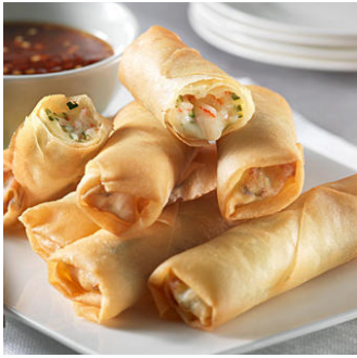
Spring Roll Party Thai Glass Noodle & Chicken OZ5042 50 units | 15g

Chicken, julienne vegetables & fine glass noodles with sweet chilli