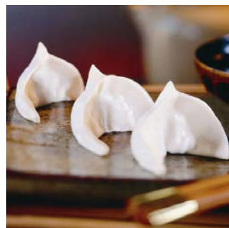
Gyoza Shitake & Tofu FFGST 50 units | 20g

A Japanese inspired dim sim with shiitake mushrooms, tofu & vegetables (vegan)