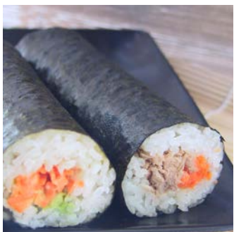
Chumaki Uncut Assorted HS001 12 units