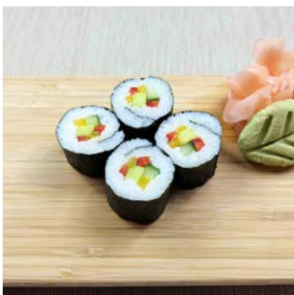
Chumaki Rolls Vegetable HS009 12 x 2 pack