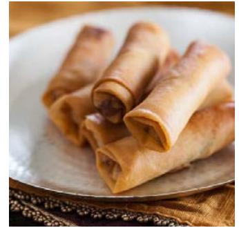
Spring Roll Party Thai Chicken OZ5030 50 units | 15g

Chicken, mixed vegetables & bamboo shoots with a fragrant Thai green curry