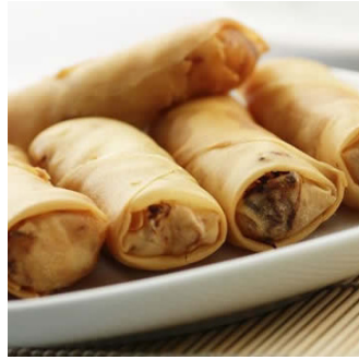
Spring Roll Party Peking Duck OZ50431 50 units | 15g

Roasted Peking Duck with Asian vegetables & Hoisin sauce.