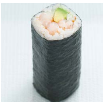
Chumaki Rolls Prawn HS012 12 x 2 pack