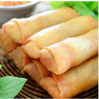
Spring Roll Entrée Thai Glass Noodle Veg OZ5040 50 units | 40g

Asian vegetables finely sliced with glass noodle with coriander, chilli, ginger, spring onions & garlic