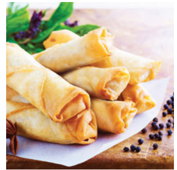
Spring Roll Large Farmfresh Vegetable LMGR03 80 units | 50g

A medley of delicious vegetables bursting with farm fresh flavours