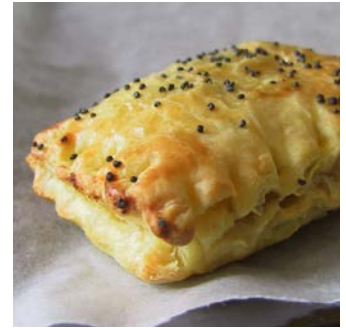
Puff Party Vegetable Vegan Curry OZ4043 50 units | 30g

Onion & potato curry wrapped in a light puff pastry parcel - delicious!