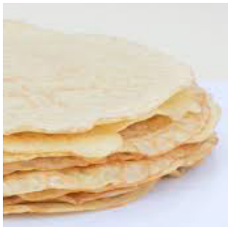
Crepes - Unfilled Duck (Ngap Phei) OZ8080 50 units

Packed in a box of 50 ready for use, simply warm and fill.