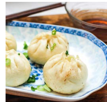
Dumpling Pork OZ1083 50 units | 25g

Filled with Pork, cabbage, chives, ginger encased in a yellow skin. Juicy!