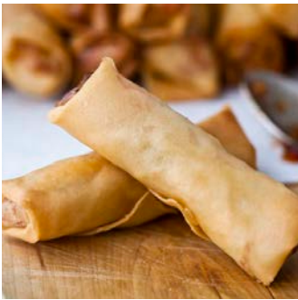
Spring Roll Entrée Peking Duck OZ5043 50 units | 40g

Roasted Peking Duck with Asian vegetables & Hoi Sin sauce.