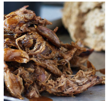
Pulled Peking Duck OZ18088 2kg

100% Australian, traditionally prepared and roasted pulled Peking Duck