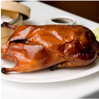
Whole Roasted Peking Duck OZ8084

Tender whole traditionally prepared and roasted Peking Duck