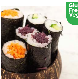
Chumaki Uncut Assorted GF Vegan HS004 12 units

12 Assorted uncut Gluten Free & Vegan chumaki rolls