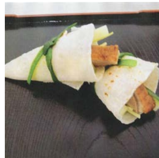
Mini Peking Duck Cones Fresh OZ8083 50 units

A delicate chive tied crepe cone filled with fresh Peking Duck and Asian Vegetables