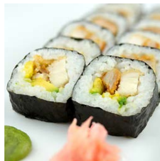
Chumaki Rolls Chicken & Avocado HS011 12 x 2 pack