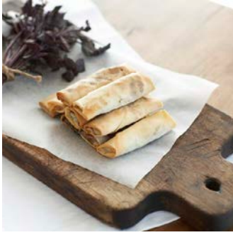
Spring Roll Large Home Made Chicken LMGR02 80 units | 50g

Fresh chicken and vegetables seared with a kick of sesame and soy