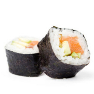
Chumaki Rolls Salmon HS007 12 x 2 pack